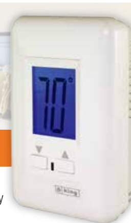
Electronic Thermostat 22AMP @120 or 208/240V