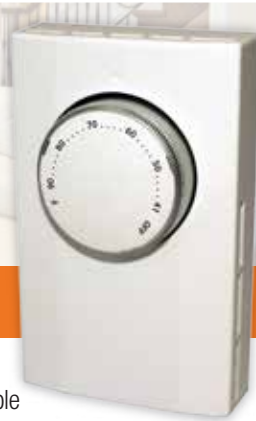
Bi-Metal Thermostat 22AMP @120, 208/240, 277V