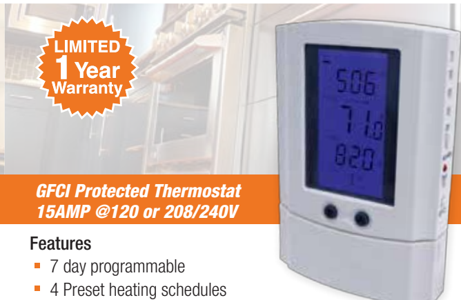
GFCI Protected Thermostat 15AMP @120 or 208/240V